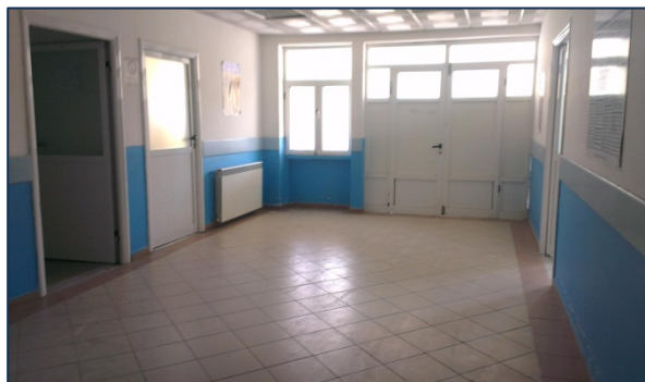
Vlora – after the investment of DiaVita with 15 new dialysis equipment for 41 patients to be treated.